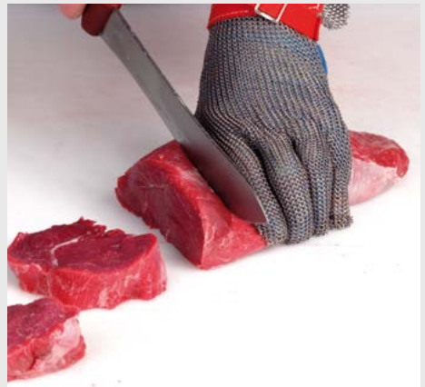
6. Cut into steaks of even thickness.