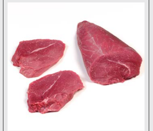
7. Blade steaks.